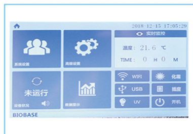
LCD touch screen