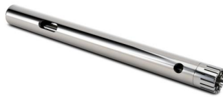
DS-500/2 Cat No.18201332

Solid and liquid dispersion Volume 10-5000mL Max. circum. Speed 22.7m/sec General purpose Emulsion granularity range 1-10µm Suspension granularity range 10-50µm