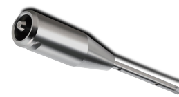
DS-500/5 Cat No.18900117

Emulsion Volume 10-5000mL Max. circum. Speed 22.7m/sec General emulsion purpose Emulsion granularity range 1-10µm Suspension granularity range 10-50µm