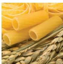
Food and Feed