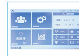
LCD touch screen