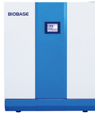
Double-layer Door (D type)