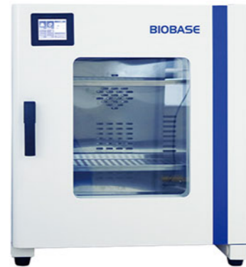
Glass Viewing Window Door (G type)