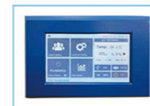
LCD touch screen