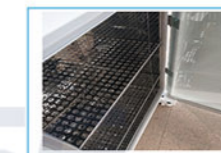
Push-pull shelves with holes