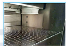
HEPA filter (for water jacket)