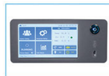
LCD touch screen