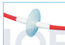
CO 2 gas filter