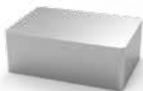
Metal cover choose J block can be used with deep well plate

Notice: K/L/M are not standard blocks, Max speed is 600rpm. MIX-A/MIX-B/MIX-C are tubes stands.