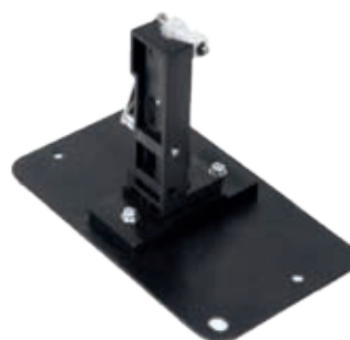
Cat. No. 18900338 Test tube holder(ø8-ø22mm)