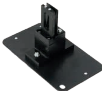
Cat. No. 18900339 solid sample holder (ø1.5-3mmø1 position)