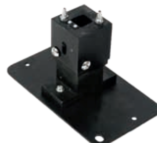
Cat. No. 18900335 10mm water-jacketed 1 cell holder (for SP-V1100 & SP-UV1100)