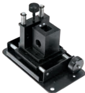
Cat. No. 18900337 Micro Cell holder