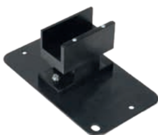
Cat. No. 18900334 cylindrical cell holder(ø16mm)