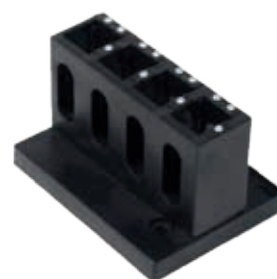
Cat. No. 18900331 4-cell holder for 10mm squ.cuvette