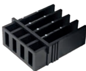
Cat. No. 18900333 4-cell holder for up to 100mm squ.cuvette