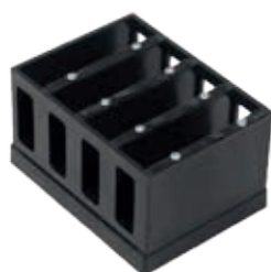
Cat. No. 18900332 4-cell holder for 10mm to 50mm squ. cuvette