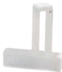
Square cuvettes glass/quartz 1-5mm/10-100mm