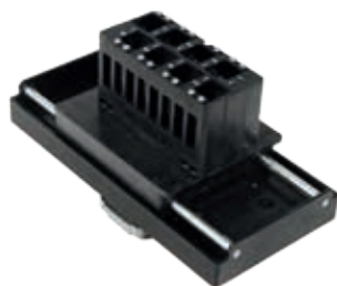
Cat. No. 18900340 8-position auto cell changer (for SP-V1100&SP-UV1100)