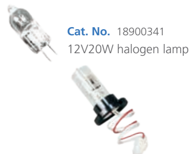
Cat. No. 18900341 12V20W halogen lamp