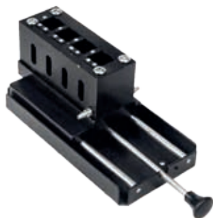
Cat. No. 18900336 10mm water-jacketed 4-cell holder (for SP-V1100 & SP-UV1100)